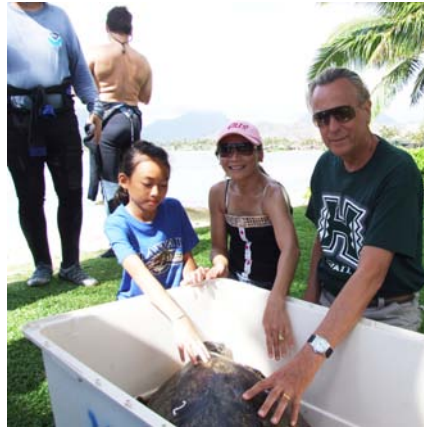
Turtle in the tub