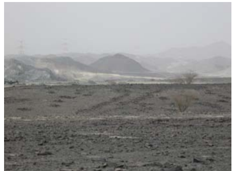
Food for thought! Stone circles and mysterious lines

Adding to the depth and excitement of the mystery was Brien's account of how he had contacted the researcher of a famous site with similar geoglyphs in Nazca, Peru, and had been told by that researcher that he had no idea what function or significance those artifacts had had.