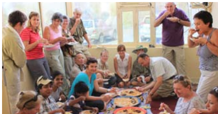
The food was very tasty

We then sought some much needed respite and found ourselves at a typical local roadside 'kitchen' offering the usual minimal fare of a raw cabbage salad, barbecued chicken, and fish tossed onto mounds of rice, served on massive platters.