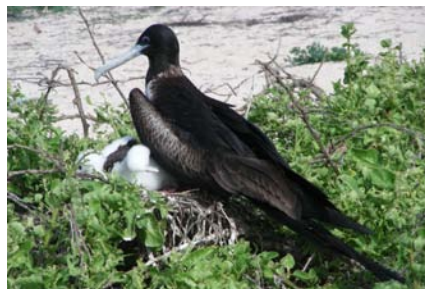
Magnificent frigate bird with chick

The creatures of the Galapagos are renowned for their lack of fear, and Colin was able to get very close to a variety of species.