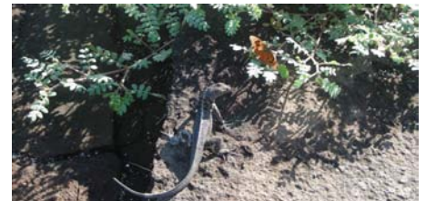
Lava lizard & (probably) Galapagos silver fritillary. Immediately after this photo, the Lizard grabbed the butterfly and ran off