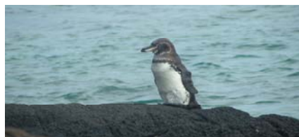
Humboldt penguin, the only penguin found in the tropics