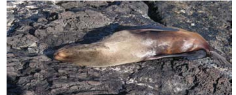
Fur seal basking