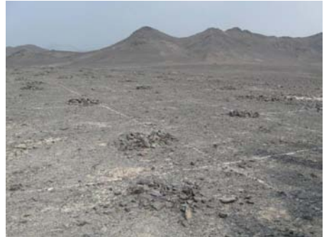
The field of undeciphered geoglyphs