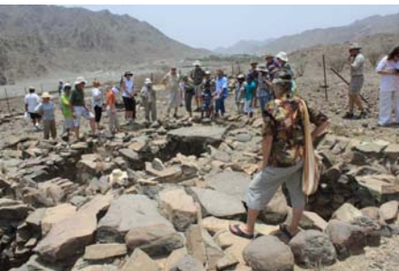
Tomb in Wadi Al Qor

The first two stops, to view a rare exposure of the "Mohorovicic Discontinuity" or "Moho" – the boundary between the earth's crust and mantle – and a 100 year old fort guarding the access to the East coast were straightforward. On our arrival at the two pre-Islamic copper mines and smelting sites in Wadi Safafir, we found thick patches of discarded slag from the ancient smelting process strewn about the ground amidst the ruins of small and humble ancient dwellings and storage units at the first site. Myriad pieces of oxidised 'refined' copper, a brilliant turquoise green, strewn about the deep shaft of a well-preserved smelting pit (and a fresh goat carcass), at the second site, confirmed my preference for this humble metal over the 'king of metals', gold.