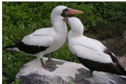
A pair of lascar boobies