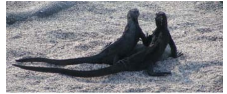
Marine iguanas, which swim & feed on algae

The creatures of the Galapagos are renowned for their lack of fear, and Colin was able to get very close to a variety of species.