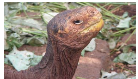
Head of a saddleback tortoise (... or ET?)