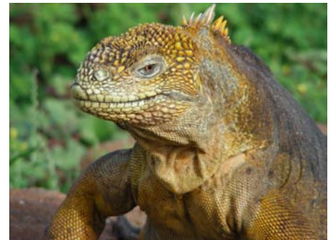
Land iguana ( Conolophus subcristatus )