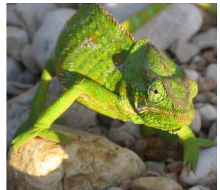
Socotra chameleon