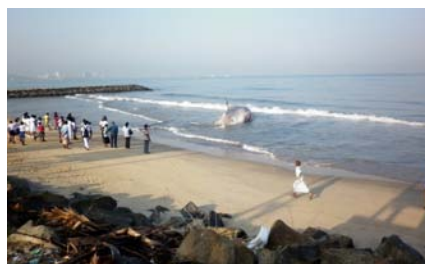
The beached whale on Watele beach

Louisa Akerina currently works on the construction of a Fisheries Harbour about 10 km north of Colombo and last month saw this whale stranded on Watele Beach near her worksite.