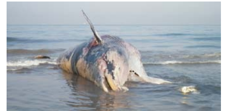
The whale appeared to have been injured; there was flesh hanging off it