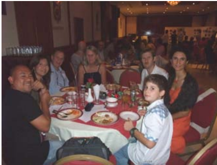
Delicious Indian food!

The annual End-of-Season Dinner and Photographic Competition was again held in the Utsav Restaurant at the India Club. We had the largest attendance to date – 73 people in all.