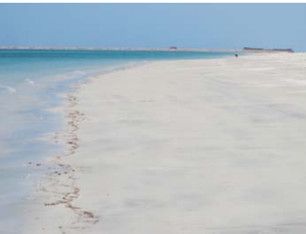
EMEG beach with The Waterfront project in background