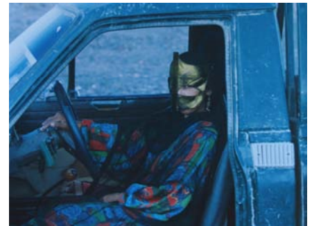
In the driving seat