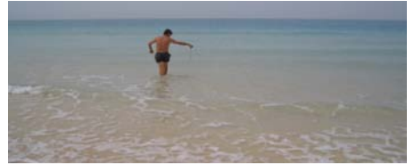
Cautiously taking the snake into the water

sea snakes are not aggressive but very poisonous this is not to be recommended!