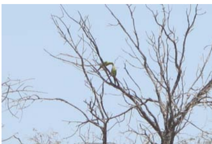
The pair of ring-necked parakeets

We also kept an eye out for birds, with happy results, although birding at Mushrif can sometimes seem to be 75% collared doves. Rob Whelan spotted a lone large raptor very high overhead, gliding effortlessly from north to south - probably a migrating juvenile eastern imperial eagle, an uncommon sighting. A pair of ring-necked parakeets, perched in an uncharacteristically exposed site at the top of a barren tree, gave us good views as they nuzzled one another.