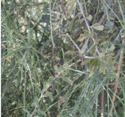
Two common climbing plants: Ephedra foliata (left) and Pentatropis nivalis (right)

common shrubs (e.g., the yellow-green succulent Zygophyllum qatarense ), common grasses (e.g., Cenchrus ciliaris ) and common sedges (e.g., Cyperus conglomeratus ).