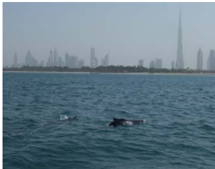
Dolphins often play close to Dubai beaches

We grabbed two rental canoes (Dhs 25 per hour for a single seater) and paddled out to the dolphins. It was a family of about six adults, two juveniles and one baby. One of the adults was much larger than the others and we thought that it might have been the same group of dolphins that we had spotted in this area before ( Gazelle Nov. 2010). The dolphins were playfully swimming around us for about half an hour, showed no sign of fear and were even playing with each other lying on their bellies.