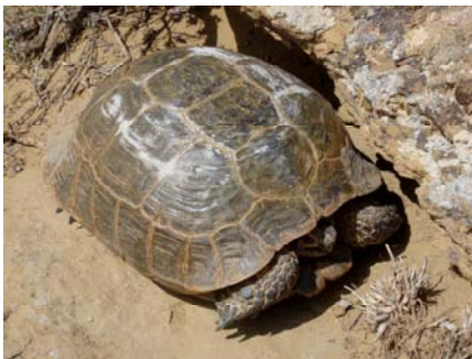
Cooperative Kazakh tortoise

The ground squirrels were too quick for photographs, but the Manthorpes were surprised to stumble across the local tortoises who were quite happy to pose.