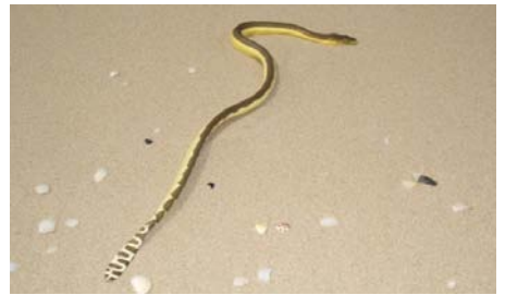
Yellow-bellied sea snake

Back in the sea, the snake was still too weak to swim properly. Soon the waves brought her back again to shore where some people started throwing stones and sand on the poor creature. We went to the small beach office for a plastic bucket, shoveled the snake in and asked the small water-ski boat on the beach to drive the snake out into the open sea which they did. So hopefully the reptile found its strength and managed to survive.