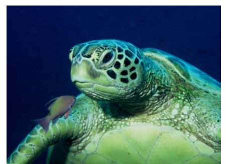
Turtle and Anthias