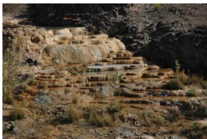
Calcite pools, on the way to Donkey Fox Wadi