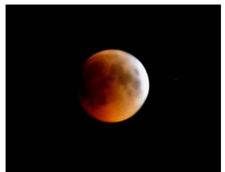
The magic moments

Lamjed's sequence of photographs had to be taken with his camera and telephoto lens, because it was too hot and humid for his telescope.