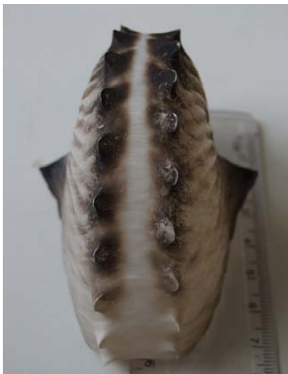
The remarkable construction of A. hians