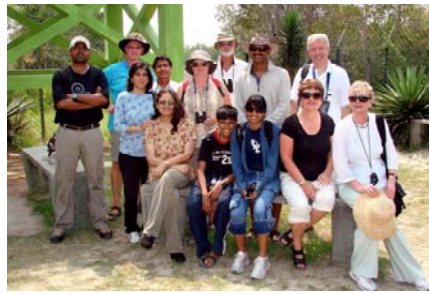
The expedition team

were not a significant problem; estimates ran from a few to none.