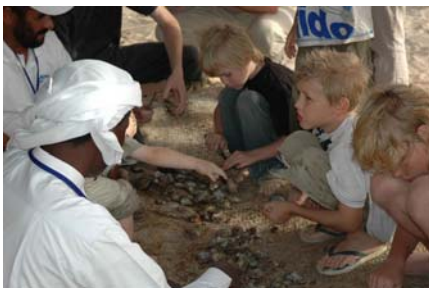
Learning how to open oysters

While pursuing their work in conservation and marine issues, EMEG have also initiated an education programme that is open to youth of various schools in the Emirates, as well as to adults – residents and visitors. Their objective in introducing the traditions and culture of the UAE is to make the public aware of the role played by nature in providing necessary resources to previous generations that allowed them to live and to survive during difficult times. Nowadays, thanks to modern technology, this close tie between men and nature has become less perceptible, but not less important, since the delicate balance between man and environment must be preserved.