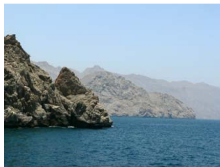
The Musandam coast is a series of lovely bays

Once aboard the beautiful, air-conditioned dhow, our disappointments were set aside as we left Dibba harbour and sailed up the coast for about 45 minutes before anchoring in a safe inlet, where we could swim or snorkel.