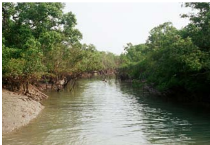
Mid-sized channel in the mangroves