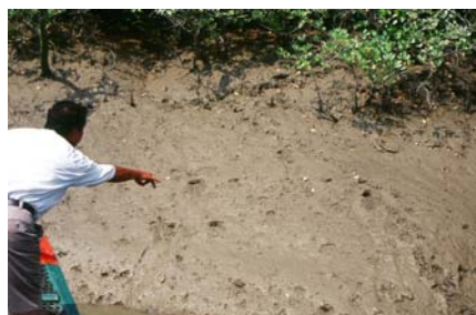
Guide points to tiger tracks

In most of the Sundarbans, it is not permitted for visitors to enter the mangroves on foot or even in smaller boats – not least because the Royal Bengal tiger has earned a reputation as a man-eater and will not hesitate to attack in those situations. Moreover, the Sundarbans is a World Heritage Site and within India it has a core zone that is off-limits even to local people, without a permit. From our boat we were nevertheless able to closely inspect several sets of recent tiger tracks in shoreline mud, as well as an estuarine crocodile, mud skippers, and more than 3 dozen bird species (plus another dozen or so in and around inhabited village areas on the fringe of the reserve). From protected concrete watchtowers and elevated walkways on land we were able to observe spotted deer, monitor lizards, monkeys, various raptors and the large lesser adjutant stork.