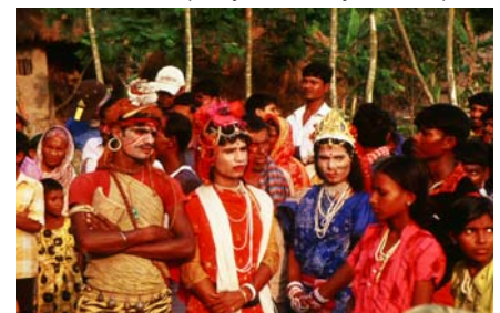
Bengali New Year celebrations

Perhaps most memorable of all, we were in the Sundarbans for Bengali New Year, and were able to witness the late afternoon celebrations in two villages near our accommodation. Colorful ceremonies involved drums, tambourines, incense, flowers, offerings, blessings and elaborately costumed characters, followed by a show of faith (auguring luck for the coming year) in the form of a succession of young men who jumped from a bamboo scaffold onto an outstretched net poised over a set of knife blades (only semi-symbolic).