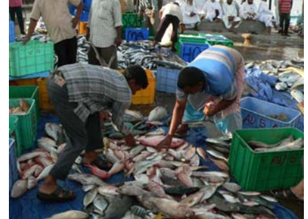
Fisherman sort their very varied catch

wards people swam or sunbathed in the afternoon sun. We returned to Dibba Oman in the late afternoon. As we came into the harbour, we noticed that the fishermen had just landed their catch.