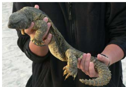
Dhubs are placid creatures