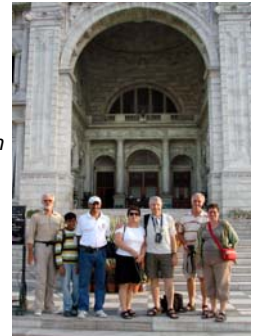
Some of the Sundarbans team in Kolkata

more people and detail in view at any given time than the mind can absorb. Once outside the city, the drive across the countryside to Sundarbans revealed a world of canals, mud brick berms, family plots with small ponds, rice fields, fish farming, tanneries and smoking heaps of scrap leather, and the tall chimneys of brick kilns, punctuated by village markets with flocks of bicycle porters – all this unfolding to the raucous accompaniment of our bus horn as the driver hurtled through.