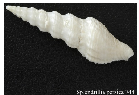
Splendrillia persica 744