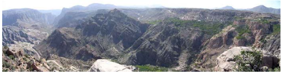
Al Ayn, one of the Saiq Plateau's many beautiful villages that DNHG members have visited

As yet no field trips have been scheduled for the coming season, but many ideas are afloat. Please think about interesting places or things that you know of, that others would enjoy, and contact the Field Trip Coordinators with your ideas, offers, or wish lists.